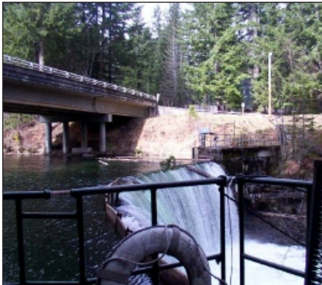
The Hemlock Dam on the Wind River will be removed this summer.