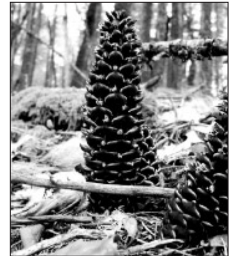
Cone plant in the Cascade-Siskiyou bioregion.