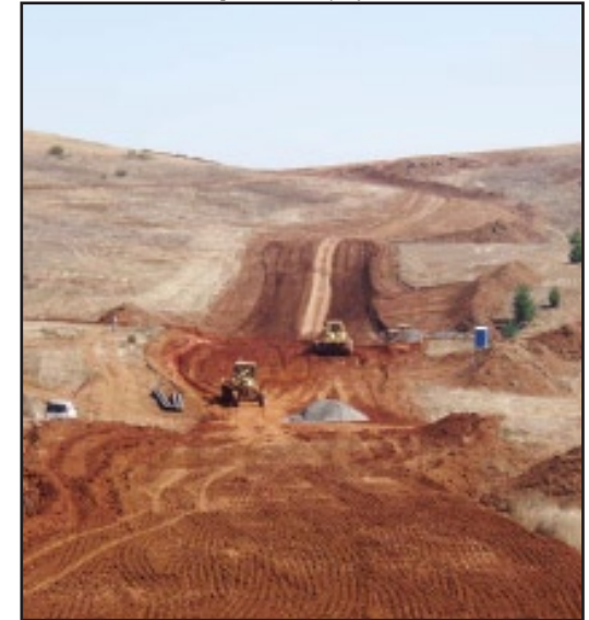
Developers race to vest near one client's property in Marion County