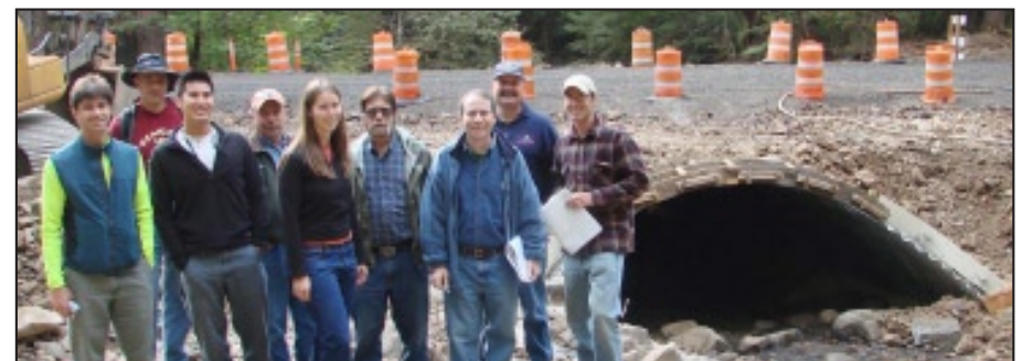
Gifford Pinchot Task Force collaborates with the Clackamas Stewardship Partners on a fish passage project on Dutch Creek.