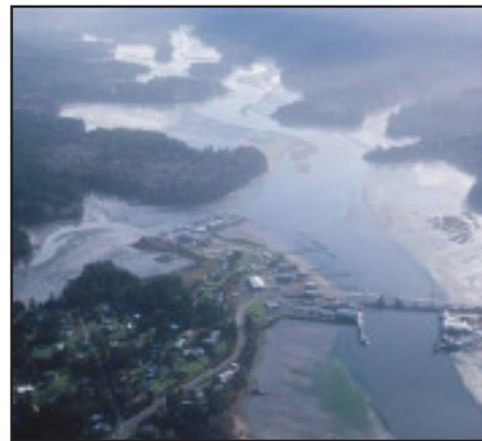
South Slough at Charleston