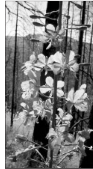
Fireweed in the Cascade Siskiyou bioregion.