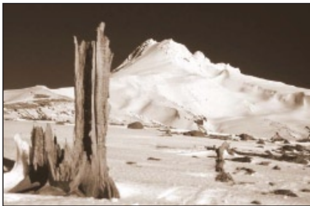
Whitebark Pine at the top of Meadows.

Our clients came together to oppose the controversial land trade and successfully advanced an alternative vision for real forest stewardship. Litigation prevented Meadows from developing the area and through mediation the parties worked out a historic solution – Meadows will offer up all of its holdings on the North side of Mt. Hood (780 acres of private land, 1,400 acre ski permit area, the Inn at Cooper Spur, the Cooper Spur Ski Area) in exchange for up to 120 acres of land in Government Camp.